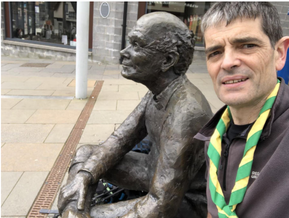
Rubbing sore feet!