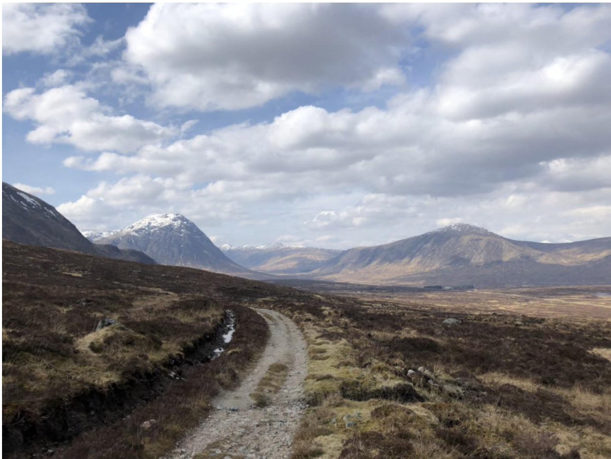
Stob Dearg and the entrance to Glen Coe